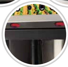
FUNCTIONAL RED DISPENSER SPOUT